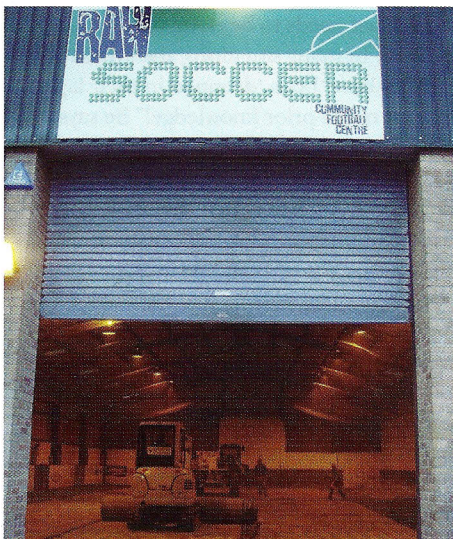
LEFT: work gets underway on the re-surfacing