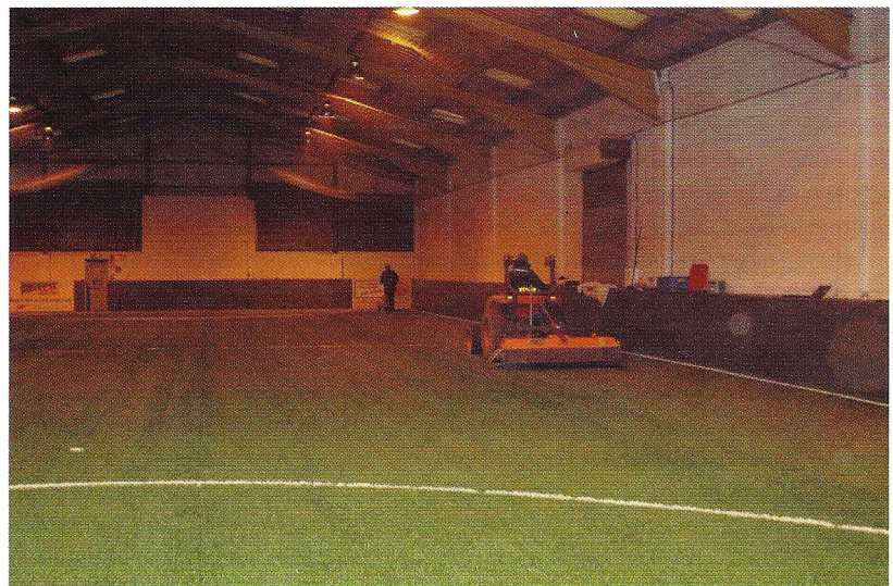
RIGHT: The new surface – fully approved by FIFA.